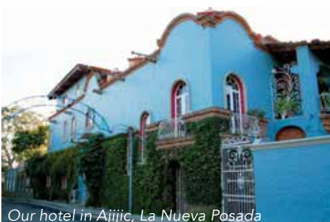
Our hotel in Ajijic, La Nueva Posada