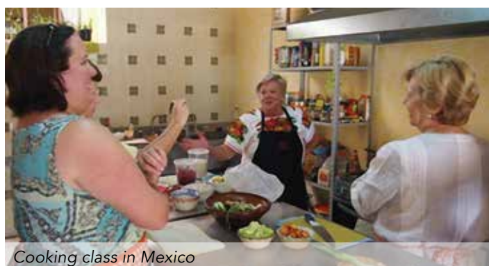
Cooking class in Mexico