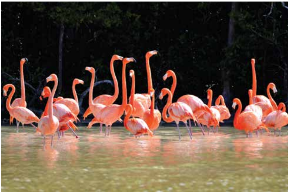
Flamingos at Celestun Biosphere