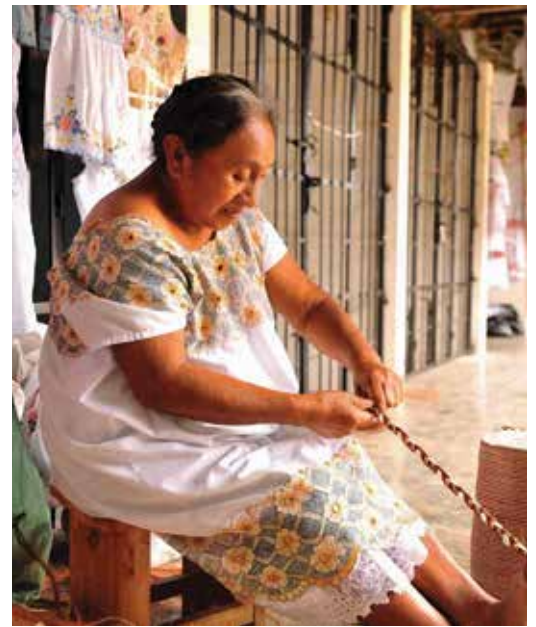
Handcrafting in Valladolid