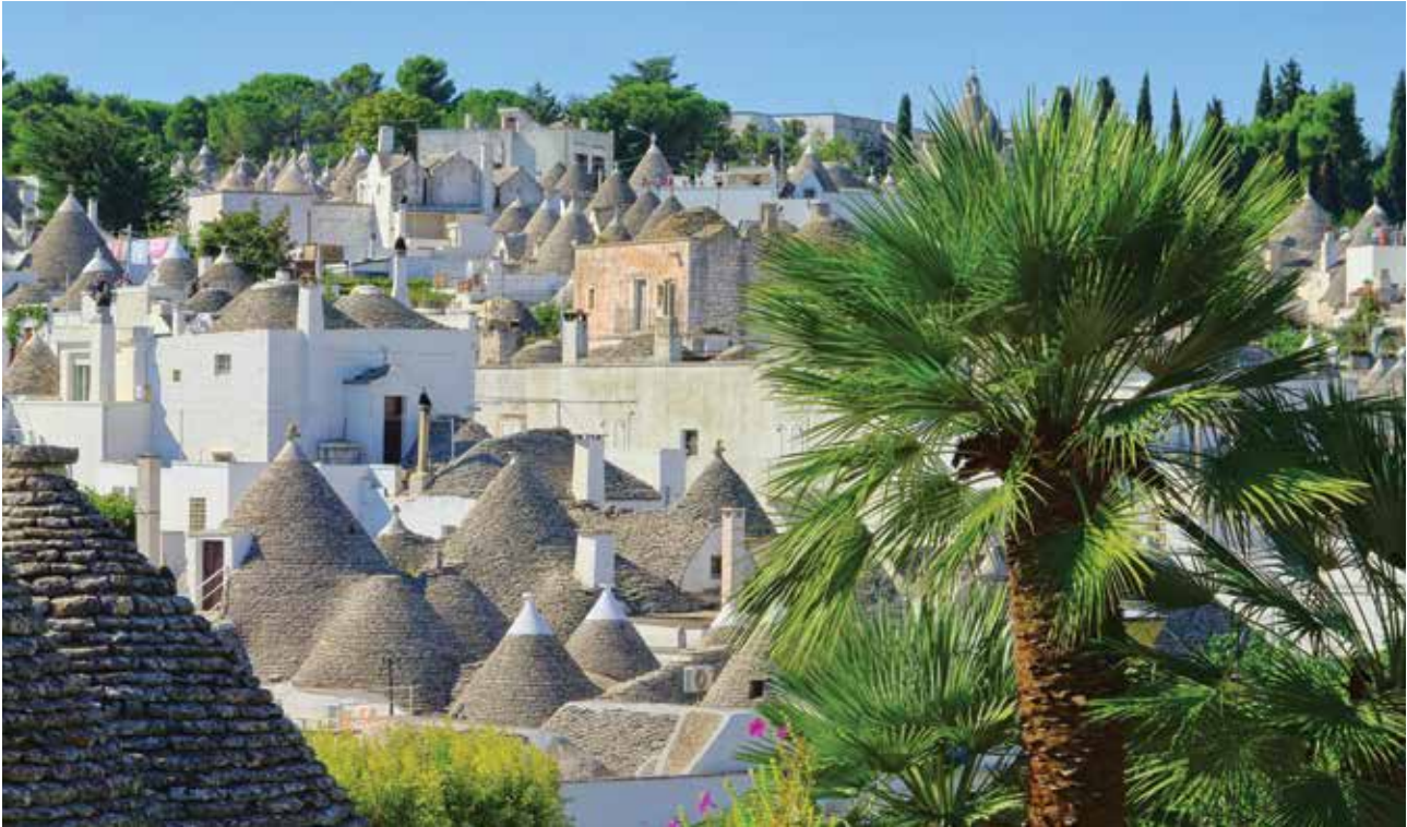
Trulli houses in Alberobello

Justing out between the sparkling emerald green and soft blues of the Adriatic and Ionian Seas, Puglia's coastline still bears the marks of its many invaders. You'll find Baroque towns, white-walled trulli, olive groves, picturesque seascapes, memorable hill-top and coastal towns and plenty of sunshine. Puglia's peasant cuisine (cucina povera) is legendary and features locally sourced olives, tomatoes, eggplants, artichokes and plentiful seafood. Its wines are among the best that Italy has to offer. This is slow travel at its best.