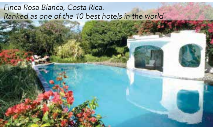
Finca Rosa Blanca, Costa Rica. Ranked as one of the 10 best hotels in the world