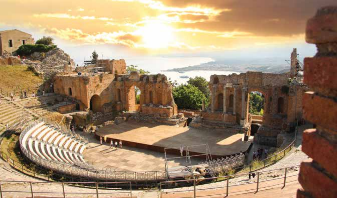
Greek Theatre at Taormina

S icily is the largest of the Mediterranean islands and nature seems to have endowed all its wonders to this land: mountains, hills and above all the sea, with its incredible colours, its crystal-clear water and the beauty of its sea beds and last but not least, its great volcanoes. The contemporary pot-pourri that is Sicily is a sum total of its illustriously varied past. Cementing its status as the crossroads of the Mediterranean Sea is Sicilian exuberance and warmth, obvious in its complex food culture, which speaks intimately of Sicilians' passion and care for good food and genuine flavours.