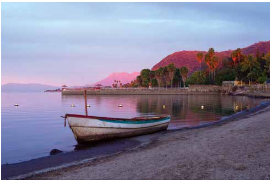
Sunrise over tranquil Lake Chapala