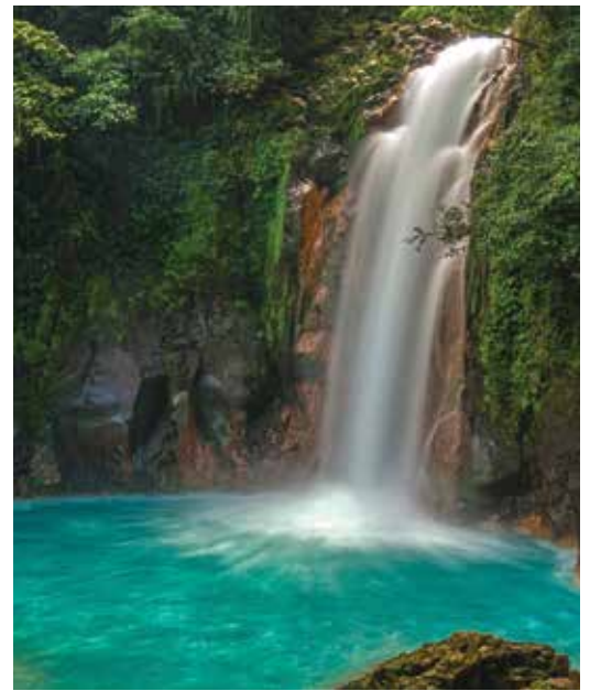
Take a dip in a cool waterfall

Day 5: This morning we're off to a traditional Tico (Costa Rican) house where our host and hostess will take us farm to table with a unique cooking class experience followed by lunch.