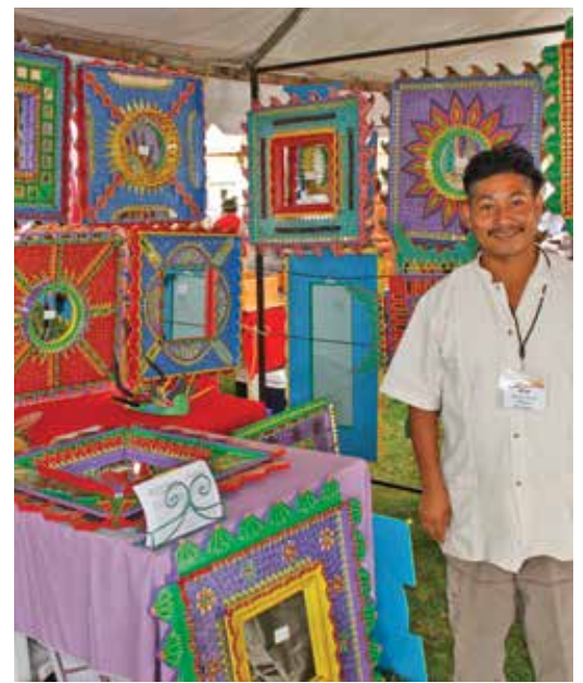
Local artisan at the Maestros del Arte Fair