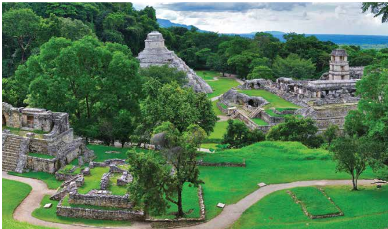
Mayan Temples at Pelanque

Y ucatan Peninsula separates the Gulf of Mexico from the Caribbean Sea. It is one of the richest archaeological zones in the ancient Mesoamerica world and presents astonishing surprises at every turn. The wonders and beauty of this region can't be over-stated. We'll explore magical towns, see an amazing range of wildlife and our expert guide will illuminate the Mayan mysteries of the area as we learn about its engineering, architecture and society. Avoiding the crowds, we'll have exclusive off-hour access to Chichen Itza the most important capital city of the Maya area and still a sacred centre for the Maya.