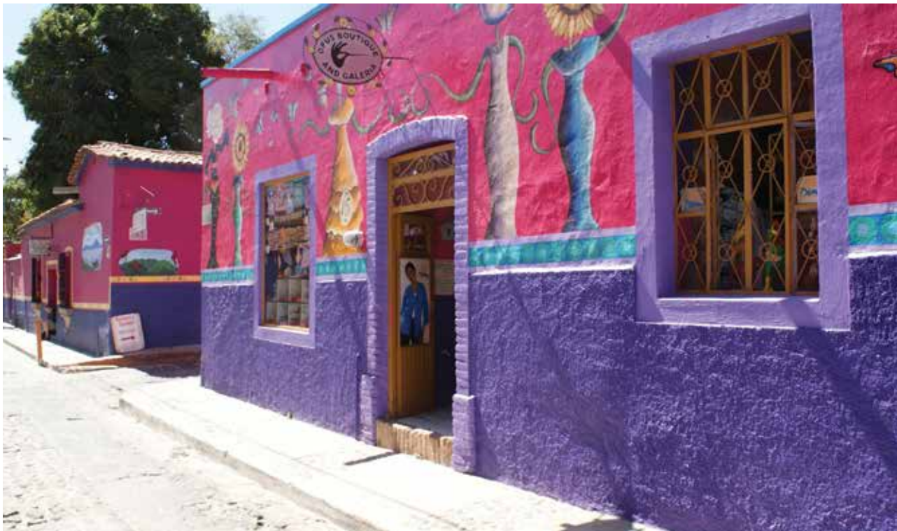
Colourful buildings in Ajijic

Unpack once – so much variety from one base – do as much or as little as you want – soak up the ambience of this delightful village which includes an active and engaged ex-pat community who chose it for its perfect climate, artistic community and friendly and welcoming locals. Ajijic nestles in Mexico's Sierra Madre Mountains on the northern shore of Lake Chapala. Only 30 minutes from Guadalajara international airport, Ajijic remains a quaint cobble-stoned village, a rustic reminder of an earlier time but with all the normal services of the 21st Century. This is 'slow travel' at its very best as we are drawn into the rhythms of daily life.