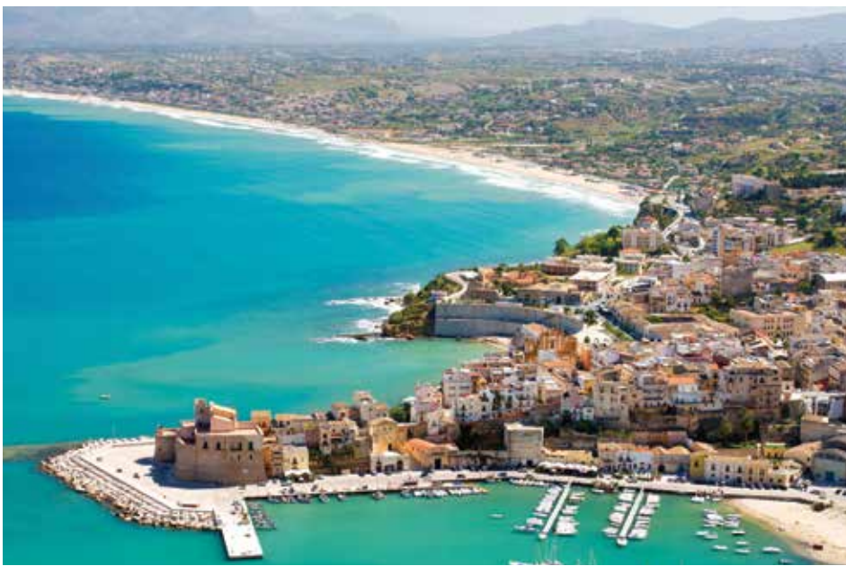
Castellamare del Golfo