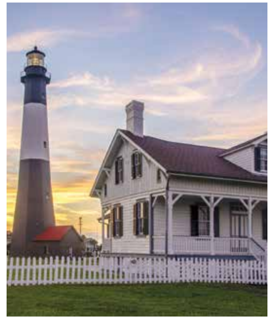
Tybee Island Lighthouse