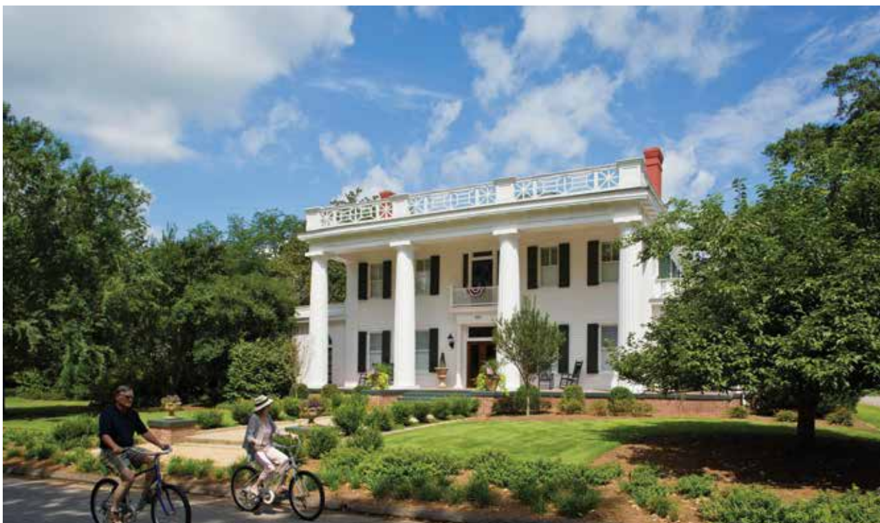
Cycle past ante-bellum homes

S avannah is one of the most beautiful and haunted cities in North America. We'll spend Halloween there, dine on wonderful food and enjoy traditional southern hospitality. Savannah, with its old plantations; huge ancient oaks hung with Spanish moss; and tales of pirates; wars; fevers; African voodoo; and other supernatural doings, has always been a legendary and tragically romantic place. Our 6 days biking adventure in the low country of Georgia and South Carolina will see us cruise through wildlife preserves and forests, pedal through tiny rural towns, and ports lined with shrimp boats. Its relatively easy riding over flat terrain with flexibility to choose the distance you wish to ride each day.